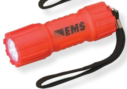
9 LED Economy Flashlight HP0240