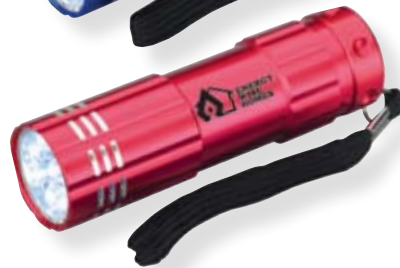
9 LED Aluminum Flashlight HP0245